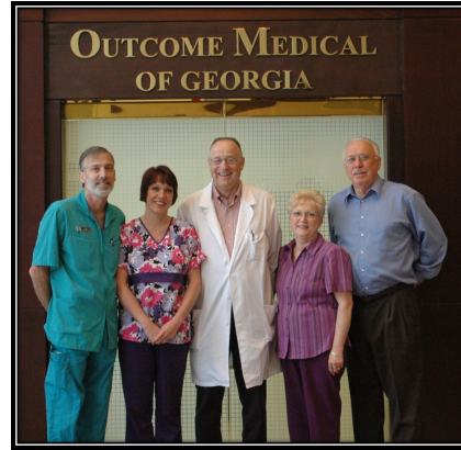
The Outcome Medical Of Georgia Staff

(See our website for technical articles)